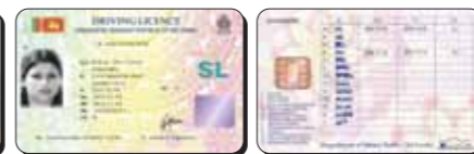
Sri Lanka Driving Licence