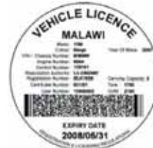
Malawi Vehicle Licence Disc