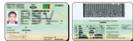
Zambia Driving Licence