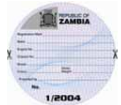
Zambia Vehicle Licence Disc