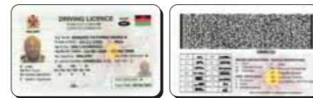
Malawi Driving Licence